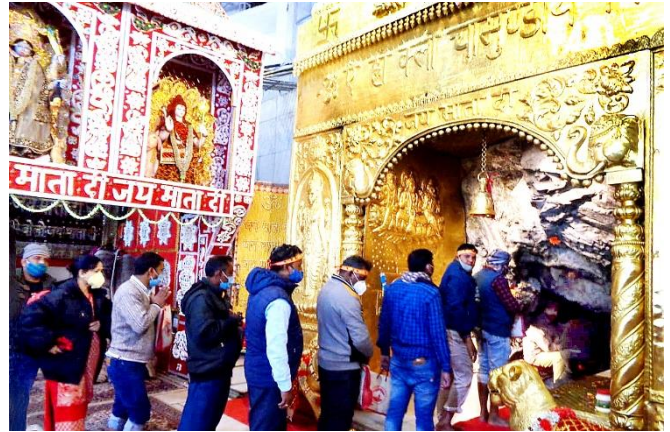
Pilgrims performing darshans via natural Cave.

smoothly and since 1 st January to 31 March this year a total of nearly 13.23 lakh pilgrims have paid obeisance at the sanctum sanctorum.