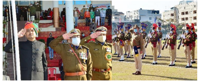
CEO Shrine Board taking salute after hoisting the tricolour on 72 nd Republic Day function at Katra.

various sports and games. He also felicitated the officers and officials of various departments and organisations and the media persons for doing a commendable job during the pandemic.