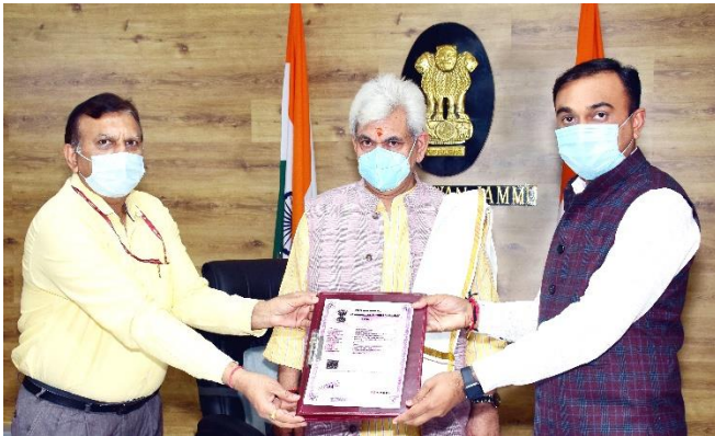
Lt Governor, Sh. Manoj Sinha at MoU signing ceremony of SMVDSB and CPWD.

The Lt Governor directed the CEO of the Shrine Board to ensure expeditious and timely completion of Durga Bhawan so that the pilgrims could take benefit of this facility at the earliest. He further directed that a PERT chart be formulated and strictly followed for time bound construction of this high utility pilgrim-centric facility. He also gave instructions for ensuring timely implementation of various components of the Master Plan for establishing infrastructural facilities for the visiting pilgrims in a planned manner.