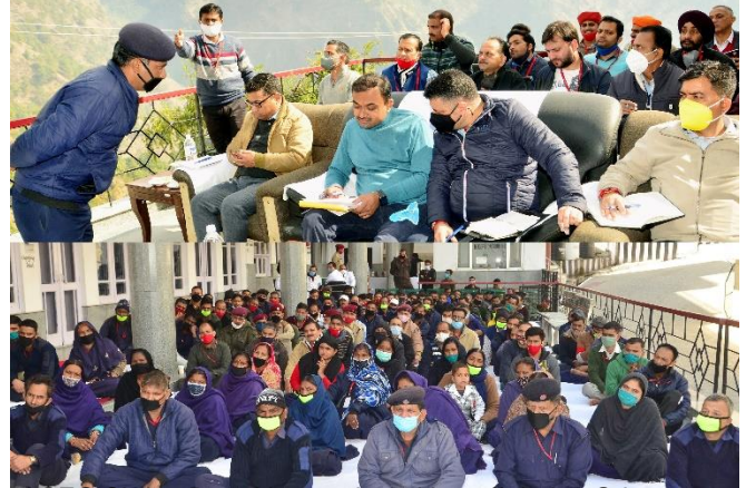
CEO Shrine Board interacting with staff during Grievance Redressal Camp held at Adhkuwari.

greater facilitation of pilgrims visiting the Holy Cave Shrine, which have been widely acclaimed, adding that all of us need to redouble our efforts and no stone should be left unturned to provide best possible services to the pilgrims to make the pilgrimage a memorable experience for them.