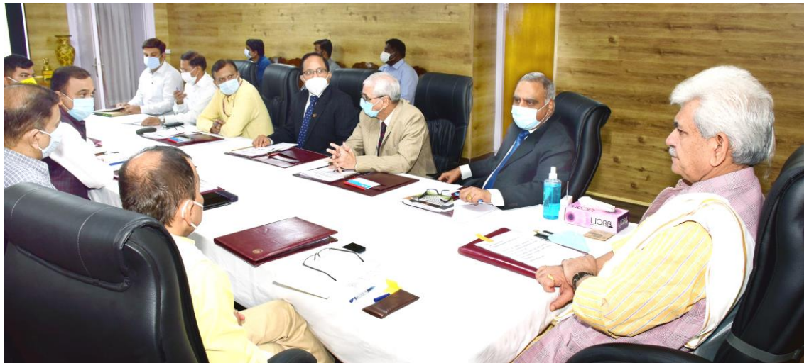
Lt. Governor, Sh. Manoj Sinha chairing meeting of SMVDSB at Raj Bhavan, Jammu.

With a view to enhance the accommodation facilities for pilgrims visiting the Holy Shrine of Shri Mata Vaishno Devi Ji, Lieutenant Governor, Manoj Sinha who is also the Chairman of Shri Mata Vaishno Devi Shrine Board, reviewed the Master Plan of Bhawan and Extended Shrine Area and modalities finalised for the construction of 5-storey Durga Bhawan at Bhawan area in a meeting held at the Raj Bhavan, Jammu on 18 March, 2021.