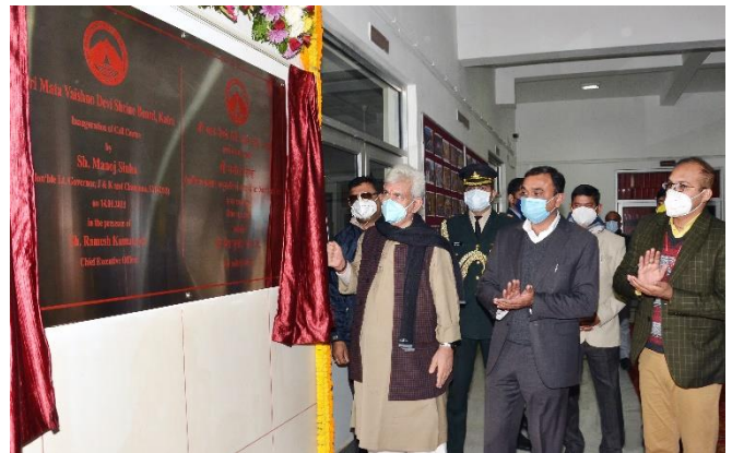
Lt Governor, Sh. Manoj Sinha inaugurating Call Centre set up by Shrine Board at Katra.

Terming the Call Centre as yet another initiative of the Shrine Board towards optimum utilization of available technologies for larger facilitation of the pilgrims, the Lt Governor said that the first such facility put in place by the Shrine Board, will be of immense help to the devotees worldwide, as their queries and grievances in regard to the pilgrimage will be addressed by providing them information sought for on real-time basis.